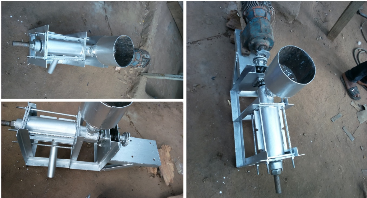
Figure 2. The constructed improved groundnut oil expelling machine showing the different sides.